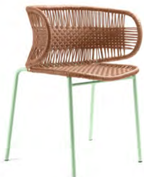
caramel brown/pastel green 00ACSCA-7