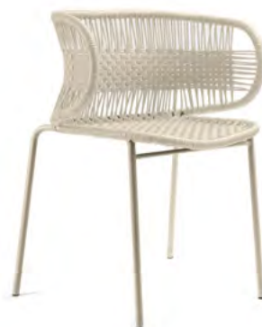
winter grey/pearl white 00ACSCA-9