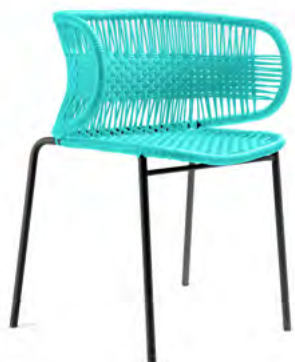
light green/black 00ACSCA-2