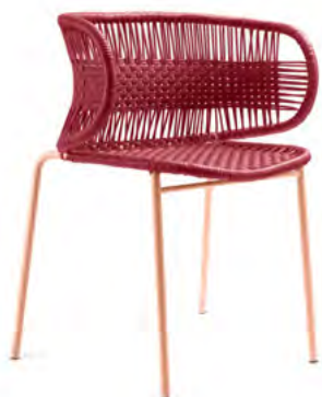
red/pink sand 00ACSCA-5