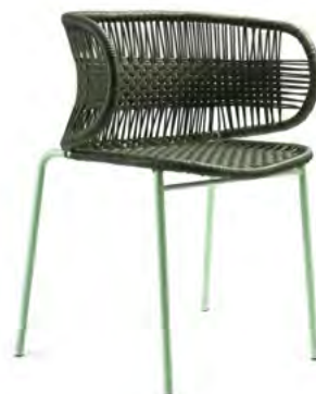
olive green/pastel green 00ACSCA-4