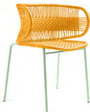
honey yellow/pastel green 00ACSCA-6